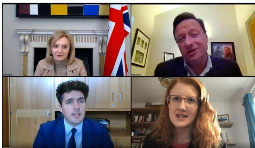
APPG co-chairs and vice-chair discussing UK trade policy with the Secretary of State!